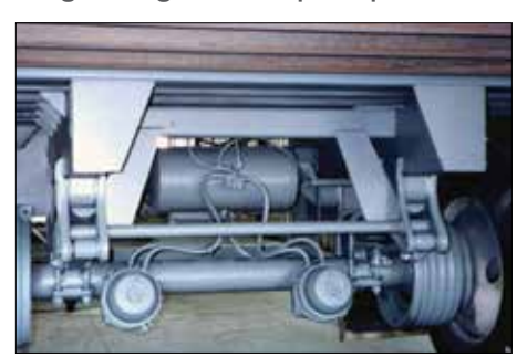
Courtesy Kijoda Sales Products: VpCI®-386, 374, 416, 426 Fleet of trucks used for coastal transport. Location: Rocky Mountains, USA

VpCls protect a multitude of metal products. Spraying or dipping metals with VpCls provides fast and economical protection for exterior and interior surfaces. Our technical staff can help you decide which product you need for long lasting and complete protection of your corrosion sensitive products.