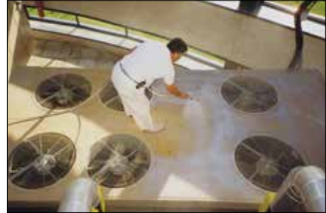
Products: VpCI®-386 VpCI®-386 used on HVAC Equipment. Location: Sevilla. Spain